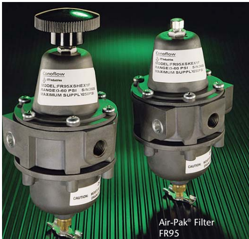
Air-Pak® Filter FR95